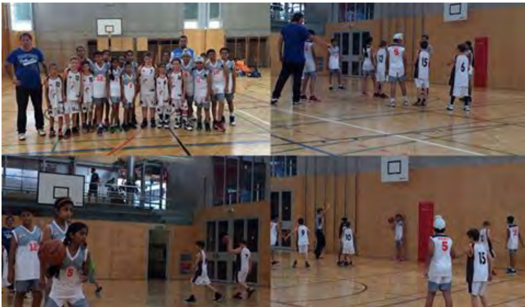
The U-10 Team won their match against Austria