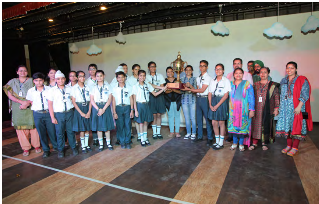
Jal House---Winner of the 'Overall Best House Trophy' for the Session 2015-16