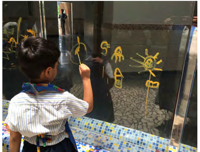
In the Activity Room