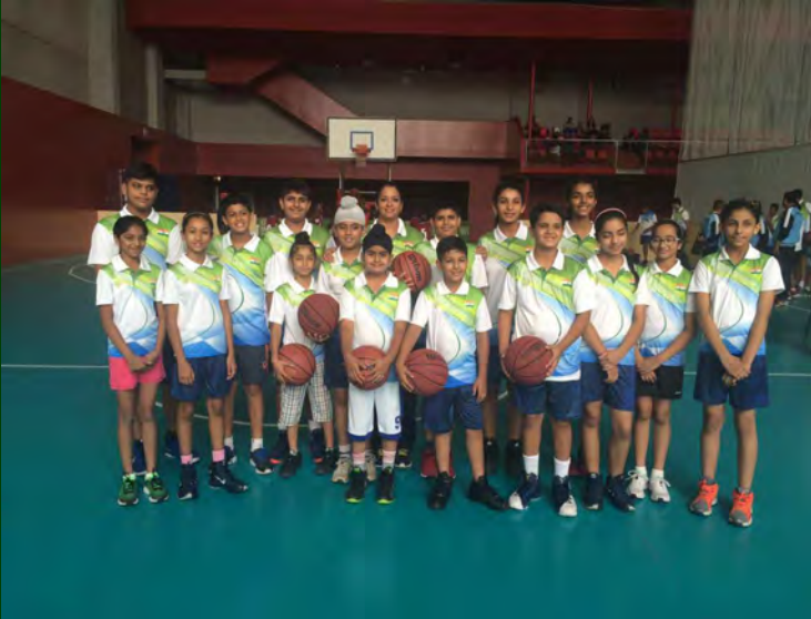
The Players had fun but did some serious practice on the Court in Klagenfurt in Austria.