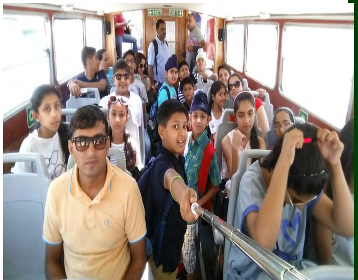
LPS Students in Vienna