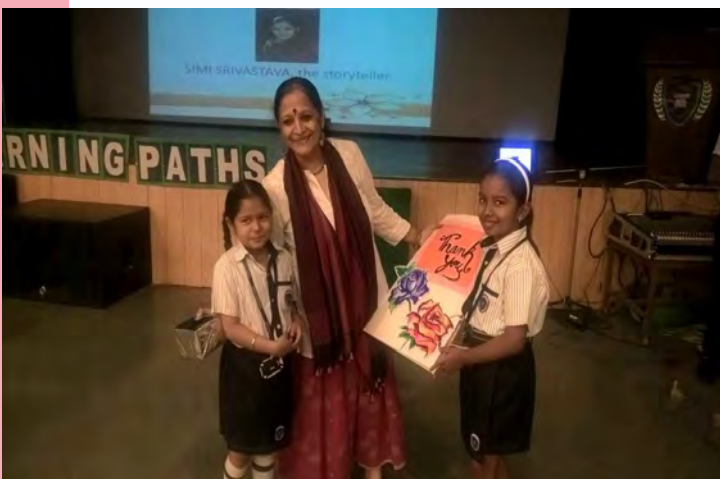
Simi with LPS students