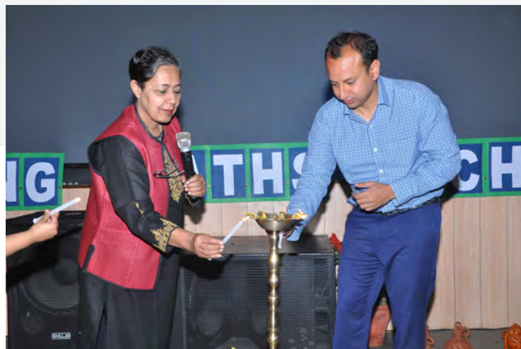
Beginning of Session 2016-17