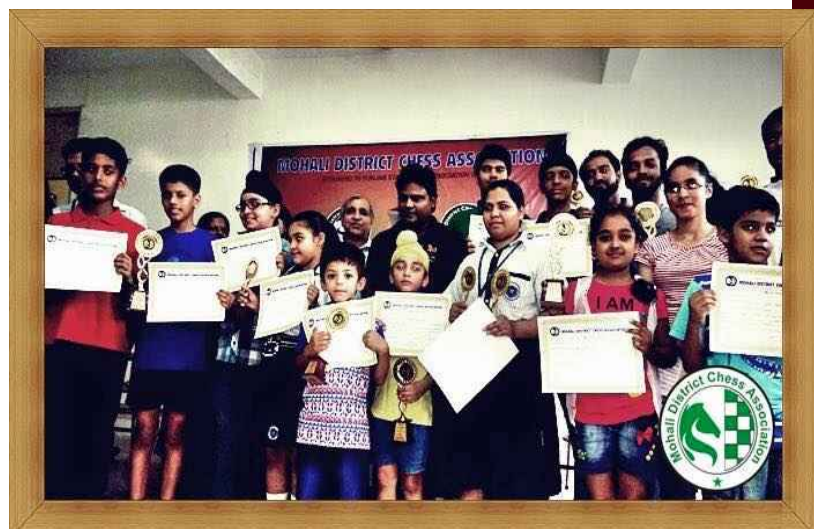
Learning Paths School obtained the FIRST and SECOND positions in the Mohali Dist. Chess Championship