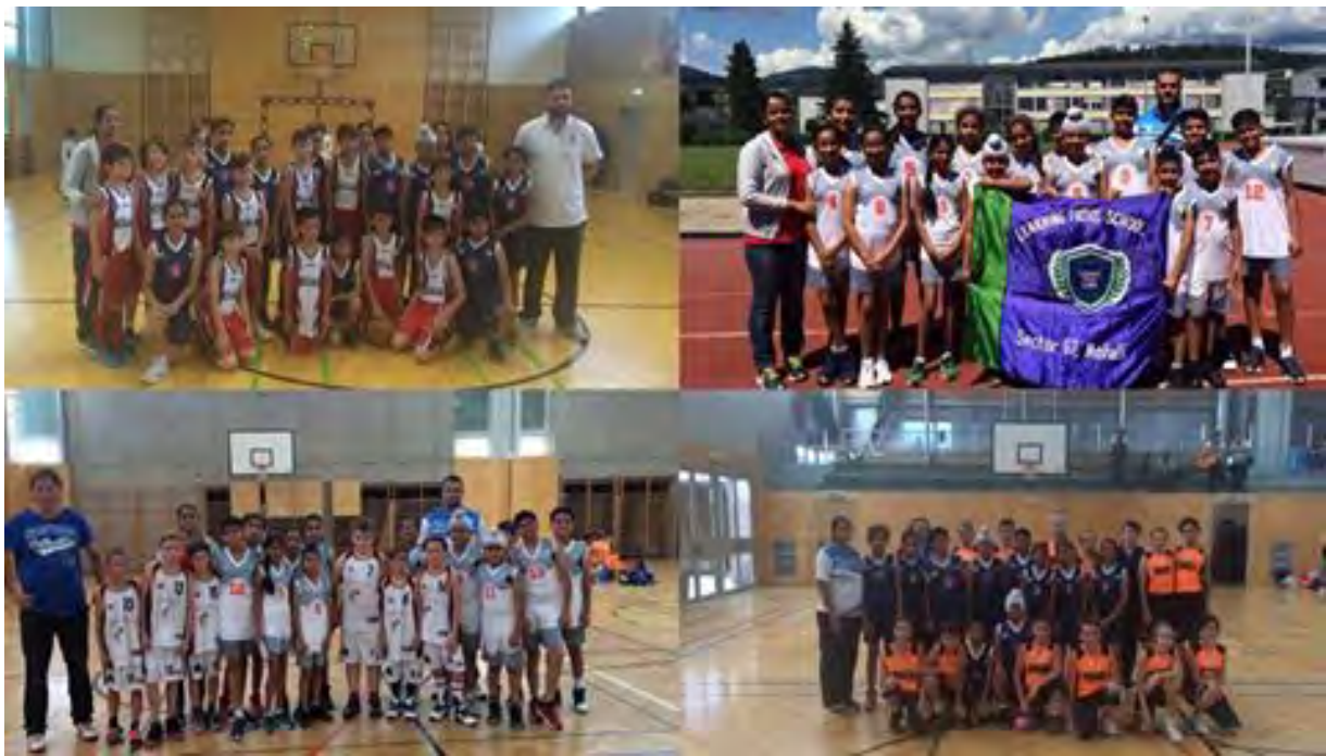
The U-10 Team won a match against Ukraine and the U12 Team won a match against Austria. Overall both teams came second in their respective pools.