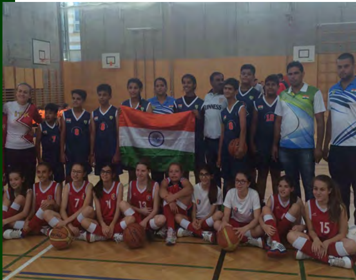
The LPS U-12 Team won against Ukraine in Austria