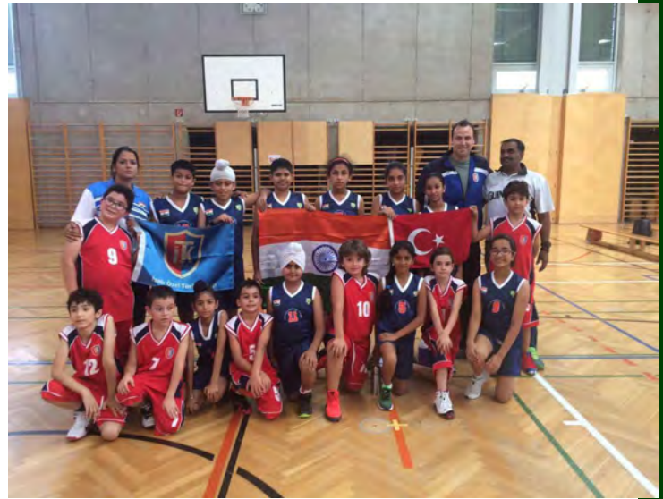
LPS Students won their first U-10 Match against the team from Turkey.