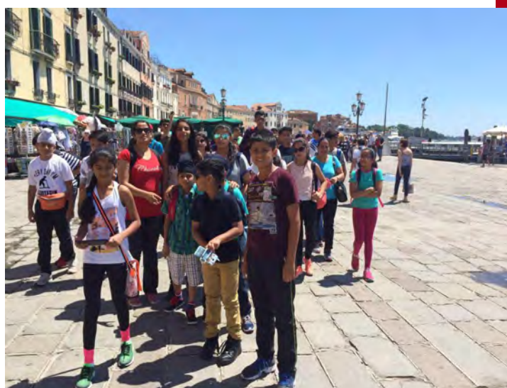
A Day Trip to Venice