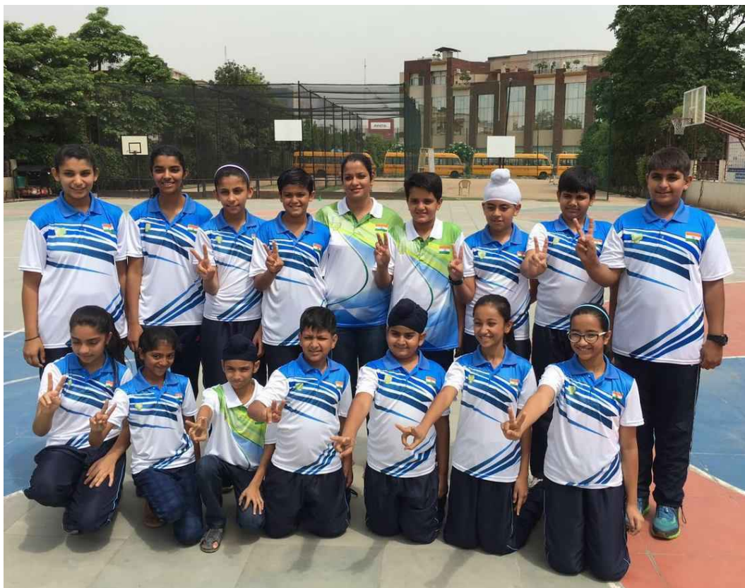
The Basketball Players---Girls & Boys---who went to Klagenfurt, Austria for the United World Games